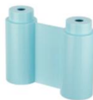
Spaced Double Tube