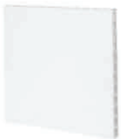
EverPanel 3ft x 3ft