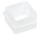
EverPanel Lug Connector