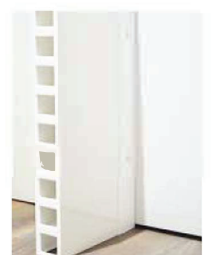
L-Shaped Channel 4ft