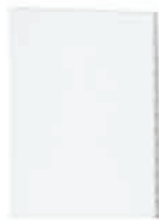
EverPanel 4ft x 3ft