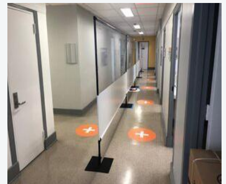
PORTABLE MEDICAL PARTITIONS