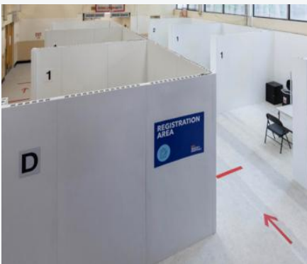
SANITARY WALL PANELS

Our modular wall systems are fully scalable, flexible, install quickly and efficiently without any tools. Instantly create separation in offices, and direct the flow of traffic for safe social distancing.