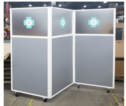
CUSTOM BUILD COLORS